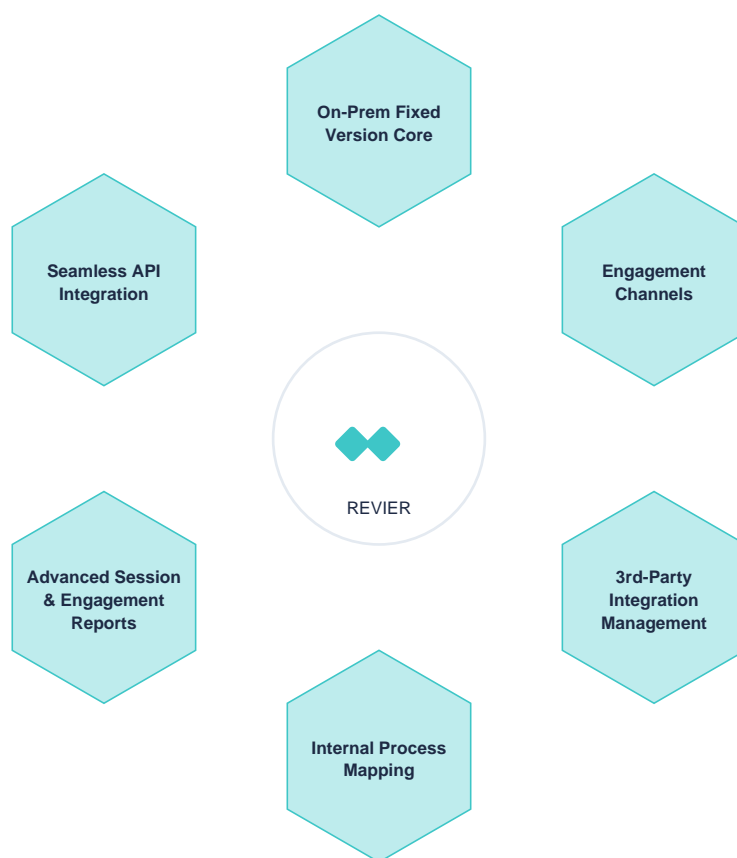
Figure 1 — The Revier platform ecosystem: six capabilities, one orchestration layer.

Your organization has already spent millions on the features inside its current systems. Re-writing those features every time the business changes is a headache — and the root cause of most failed transformation programs. Revier takes a different approach: it integrates your existing features as re-usable Actions , then gives business leaders a visual canvas on which to assemble them into the processes you actually need today.